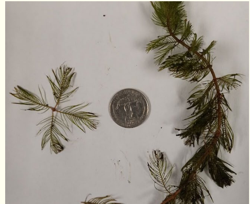
Bass Lake WBIC 417900, EWM Survey, 8/7/2024